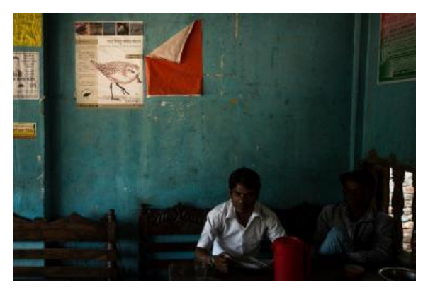
SBS poster in a local restaurant

Figure 3. World Migratory Bird Day, Sonadia Island May 2013.