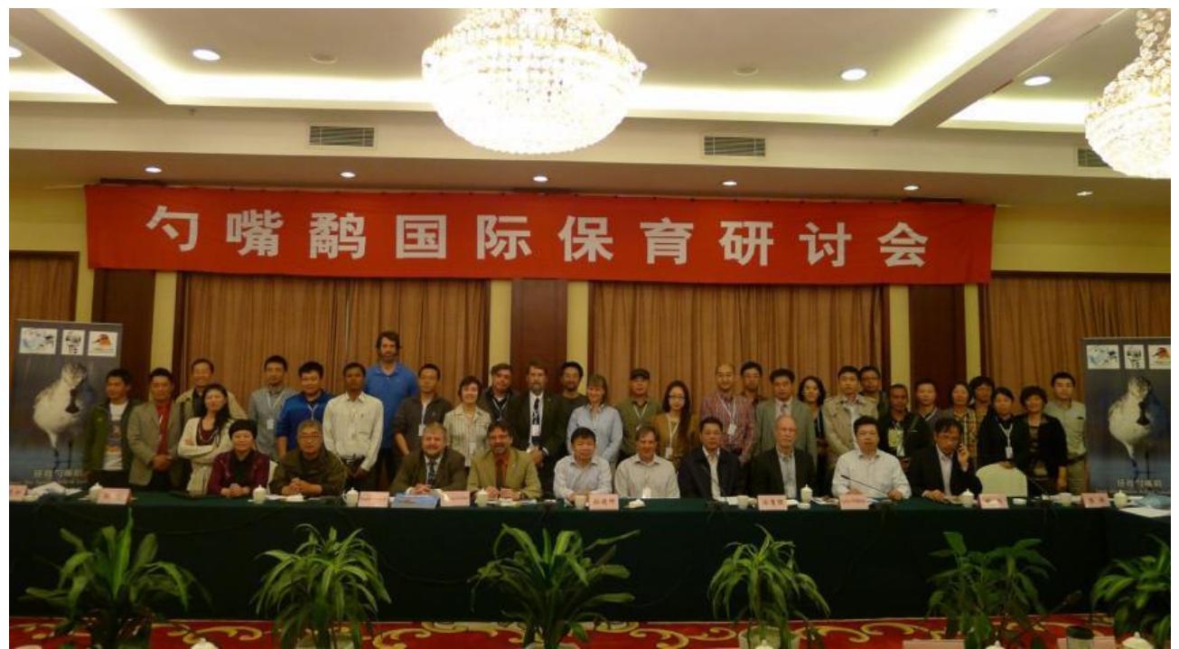
Workshop participants in Rudong 20 Oct 2013

SBS in China organized an extremely successful two day workshop for all interested stake holders who are willing to move Rudong's conservation status to the next level. Participants included provincial and local government officials, national and international NGOs, Universities and the EAAFP secretariat among many others. There were a series of presentations and four workshop sessions (Hunting, Research and monitoring, Spartina control and Site protection/advocacy). There was wide agreement about the actions that were needed in all the workshops but the most important outcome was from the sight protection/advocacy workshop where the need for protection of the core areas was received well by the government officials who were present.