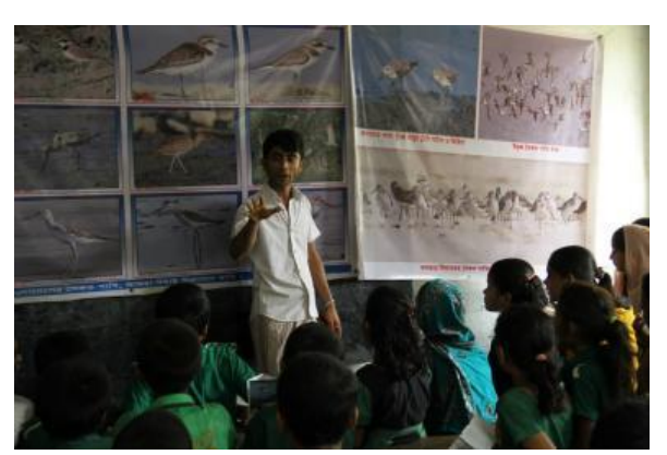
An ex-hunter talking about SBS conservation and his commitment to save it, WMBD May 2013