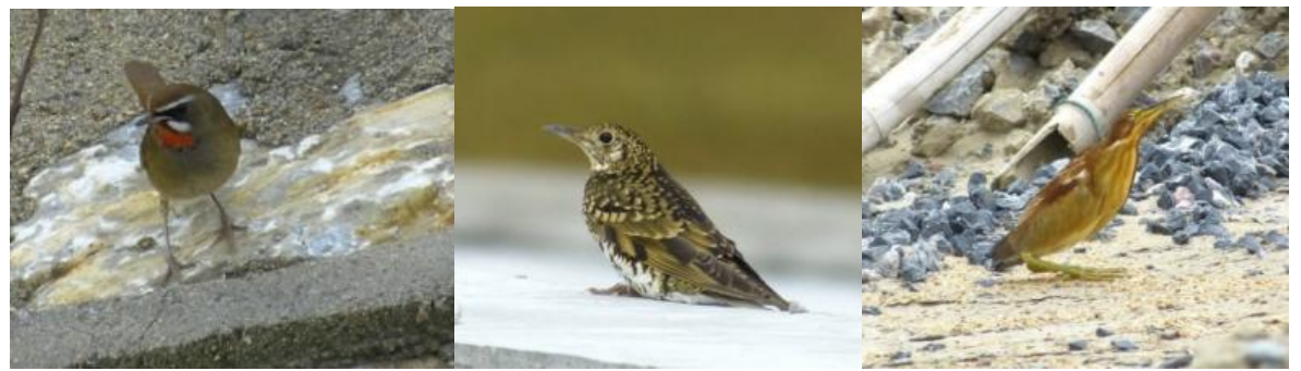
Tired migrants along the seawall at Yangkou: Siberian Rubythroat, White's Thrush & Shrenck's Bittern.

The weather the following day was kinder; dry, overcast and far less windy. With a later tide, there was time to watch waders on the flow tide just south of Haiyin Temple. Concentrating on counting waders required serious self-discipline as large numbers of birds were on the move, from ducks over the sea to hirundines and passerines streaming overhead. Pipits, larks, wagtails and buntings were a constant distraction and as if this wasn't enough, a few Saunders's Gulls and then a Relict Gull (a bird I'd missed on a previous trip to China) arrived as tide peaked and the waders began to flock together. It was clear that after the strong northerlies and passing cold front yesterday there was some serious re-orientation and migration going on! Heading back to yesterday's high tide roost with our driver, tired migrants were very much in evidence along the seawall. Clearly in no state to look for more suitable habitat, a stunning male Siberian Rubythroat blew us all away sat out in the open atop the new concrete seawall. A little further along, a riot of black, white, gold and bronze, a stunning White's Thrush did likewise! Then most bizarrely of all, a Shrenck's Bittern was found hunched alongside a pile of gravel and bamboo canes!