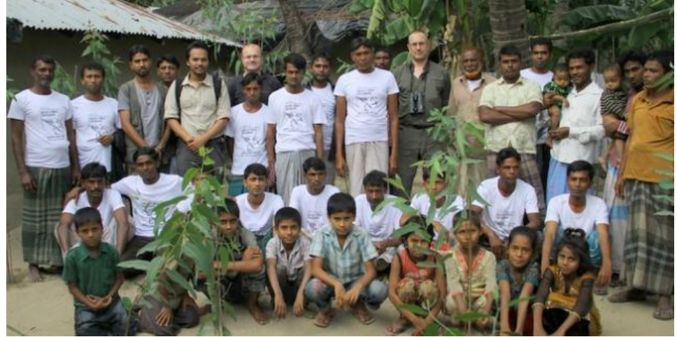
RSPB's visit on Sonadia Island and meeting with ex-hunters, November 2012