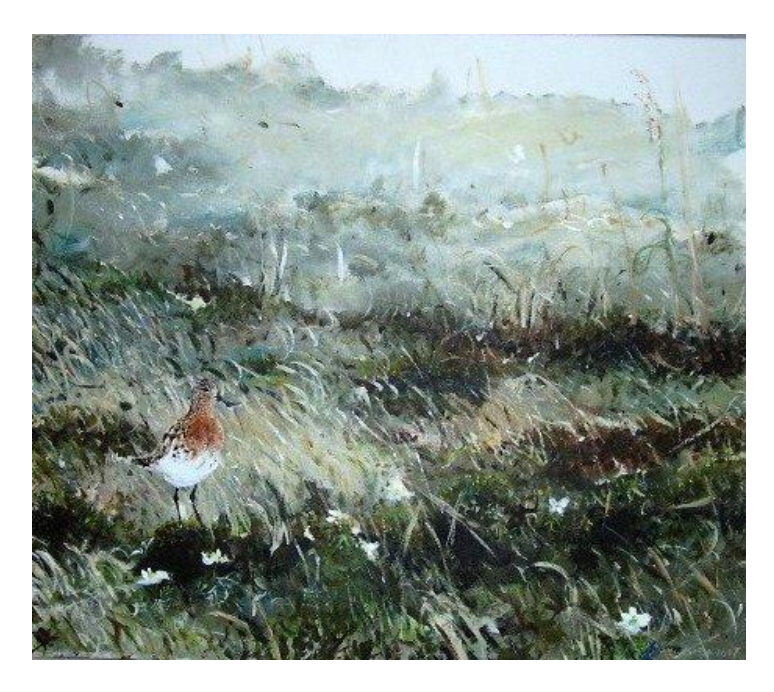
Spoon-billed Sandpiper at breeding conditions, Rus. Koshka spit, 2009 (acryl)