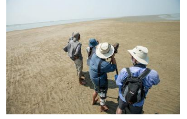
Shorebird survey at Soandia Island with trainees, Mar 13