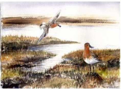
Pair from Russkaya Koshka spit, 2011