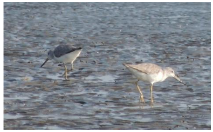
Two of a total of 26 Nordmann's Greenshank

According to Morozov and Archipov (2010), Black tailed Godwit, Great Knot and also Broad-billed Sandpiper were recorded in slightly higher numbers in January 2010 (almost four years earlier), whereas Nordmann's Greenshank and Eurasian Curlew appeared to be more numerous in 2013.