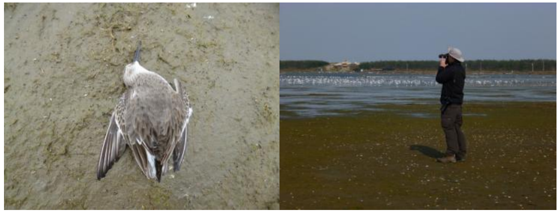
A poisoned Dunlin and counting the Saunders's Gulls at Dongling.