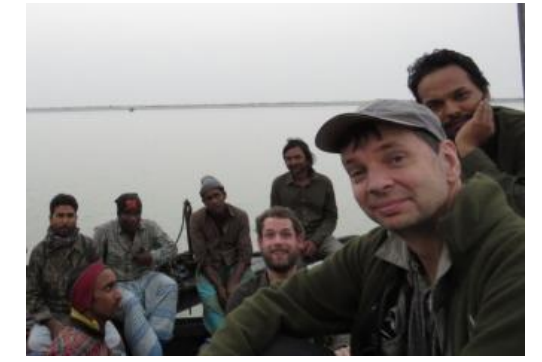
Shorebirds survey in the Sundarbans, Jan 2013