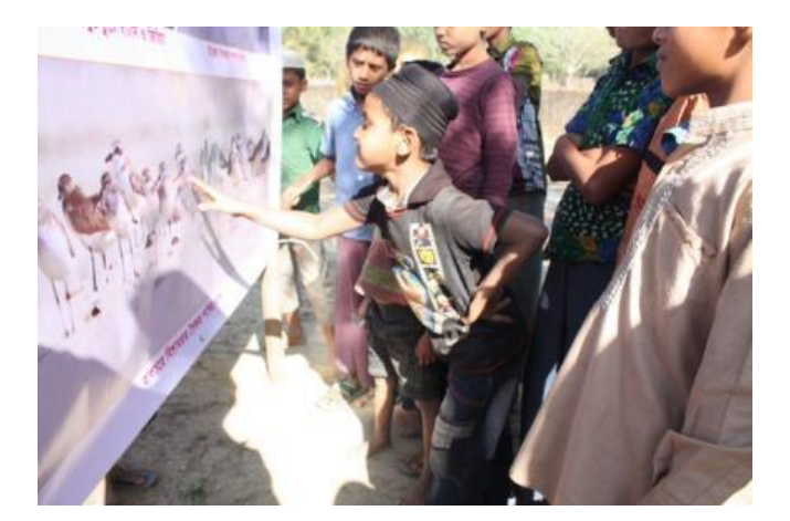
Figure 1. Spoon-billed Sandpiper awareness campaign on Sonadia Island December

In addition to regular monitoring at Sonadia Island, the BSCP team also surveyed Sundarbans (four SBS were recorded from Egg Island on the edge of the Sundarbans on 24 February 1992) in January 2013; 1,542 shorebirds were counted with no SBA (Table 3). Patenga beach of Chittagong and Domar Char (Nijhum Dweep) of Noakhali were also surveyed for SBS but none were found