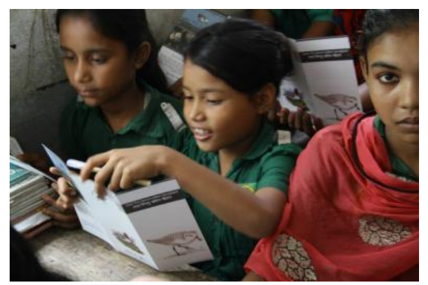
School children reading SBS pamphlet to participate in SBS quiz competition, WMBD May 2013