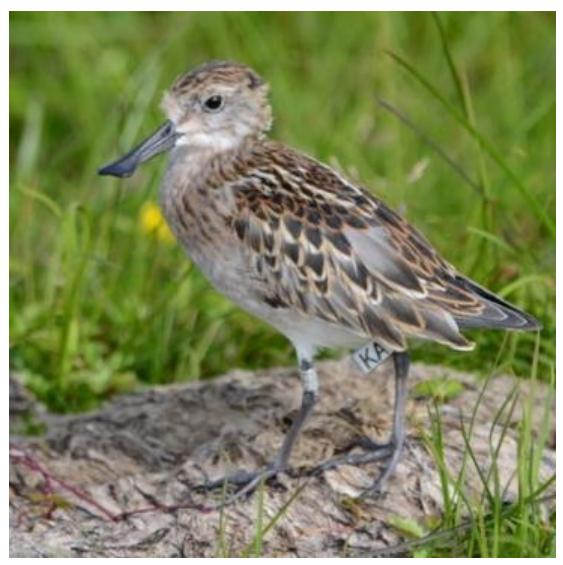
A fledged and released SbS from 'Head Starting Project' in Meinypilgyno, Chukotka on 28 July 2013

These results of re-sightings in 2013 are very promising. We assume that if adults with ELFs successfully return to their breeding grounds next year, the colour-flagging will be continued in Meinypilgyno, and hopefully with this approach we will get much new valuable information on migration parameters, natural history traits and some demography characteristics of the SbS that are important for our understanding and for conservation of this critically endangered shorebird species. It is interesting to note that all observations of SbS from southern Chukotka, of this and former years, came from wintering grounds in southern China and Thailand, while records in winter months of birds tagged with light blue flags in northern Chukotka originated from Bangladesh, Myanmar and only once from Thailand (on 1 March 2006). This means that birds from the two breeding populations spend winter possibly in difference in distribution may explain the difference in the current