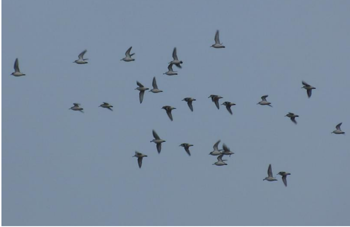
22 or 23 Spoon-billed Sandpiper in Rudong, China