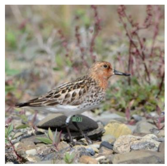
SbS male '01' warning near chicks from a replacement clutch .

One more SbS originating from Meinypilgyno was recorded in Rudong area, Jiangsu, southern China, on 5 October 2013 (information from Mr.Zhang Lin). It was carrying a plain light green flag on the right tibia which indicated that this bird was flagged as an unfledged chick. Luckily, the bird was photographed by several observers quite closely from different sides enabling them to read the digits on its metal ring: MOSKVA KS18181. This ring was placed on an SbS chick on 13 July 2010, thus, confirming the origin of this flagged bird.