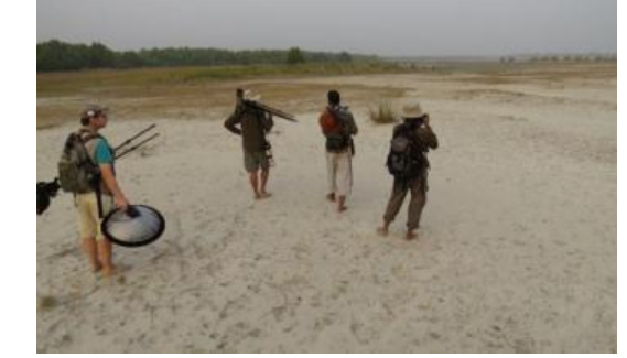
Shorebirds survey in the Sundarbans, Jan 2013

Figure 2. Spoon-billed Sandpiper surveys and hunting mitigation work.