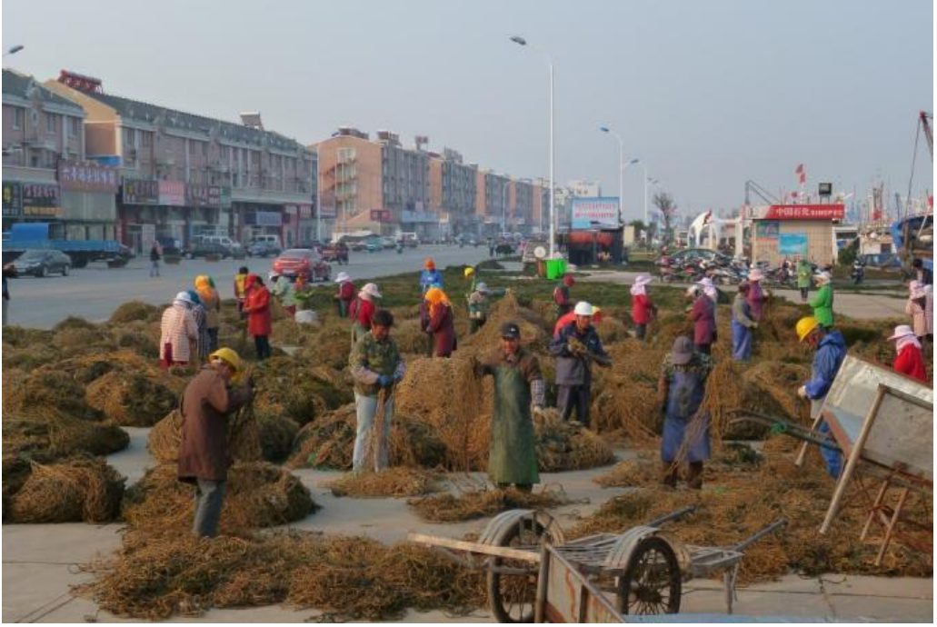
Typical early morning harbour-side scene in Yangkou

I arrived in Rudong on 14 October and met with members of the Task Force. Our hotel was on the main drag along the edge of the harbour in Yangkou, very atmospheric especially early in the morning with fishing boats moored up as far as the eye could see, armies of fishermen tending their nets whilst street food vendors prepared a selection of deep fried breakfast items across the road. The surrounding landscape was hardly picture postcard however with factories and industry dominating the surrounding area. A nasty, gaseous discharge from one of the factories behind the hotel each evening wasn't kind on the senses either!