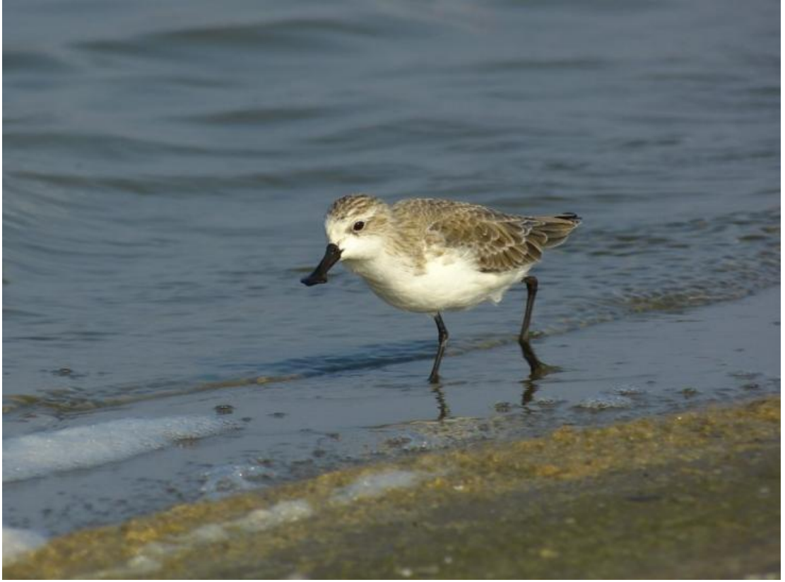
Spoon-billed Sandpiper feeding on pool edge at a high tide roost site near Yangkou.

Another site which proved to be really attractive to waders, including Spoonies, was a set of fishponds and lagoons to the southeast of Haiyin Temple. Here we were treated to incredibly close views as we lay on our bellies on the windward edge of one particular pool where the breeze was clearly depositing ample food items on the shore. One particularly aggressive bird defended a fifteen metre stretch of shore, constantly running from one end of its chosen patch to the other, feeding along the way, but finding plenty of time to attack Red-necked Stints and Dunlins that attempted to feed in the same area, all whilst we lay beside them only ten feet away at times!