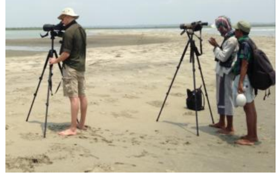
Shorebird survey at Sonadia with RSPB, Apr 13