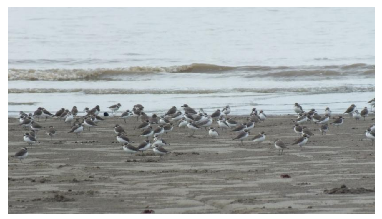
Waders regularly landed near the village

During the capacity building and bird-watching training I met with Aye ko and Nyunt Swe and got wader information on their regular checks on the mudflat at the pre-wintering season between September to November. According to their records, on 5th October some winter visitors landed near the Shwe-thar- hlaung pagoda in Ahlat village. Between September and December the bird flocks were seen at regular places in the morning (7-9 am) and in the evening (3-6 pm) at mid tide. During spring tide, flocks were seen at the same places in the morning (2-3 am) and in the evening (5-6 pm). Some mudflats were not flooded during neap tide and the birds then did not land on their regular places but stayed near the tide. During high tide flocks were seen in the regular places in the afternoon.