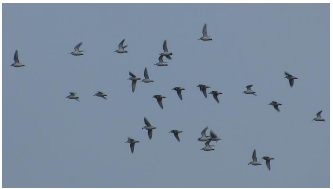
23 Spoon-billed Sandpipers leaving a high tide roost site near Yangkou.

Peregrine. One group of Spoonies was particularly vocal with lots of trilling and interaction going on. Then suddenly part of the flock took flight with other waders, flew overhead doing a couple of circuits of the area, gained height and headed off towards the coast calling frequently. I'd taken a few photos of the flock as they flew overhead but it wasn't until I was back in the hotel that evening that I'd realised I had a few shots of a flock of 23 Spoon-billed Sandpipers flying overhead! The next day, there were far fewer waders at the fishponds and only three Spoonies remained. Had I witnessed a pre-migration gathering? Difficult to be sure but their behaviour and vocalisations were certainly striking.