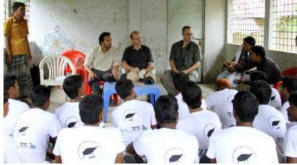
Meeting with ex-hunters, BSCP and RSPB, Nov 2012