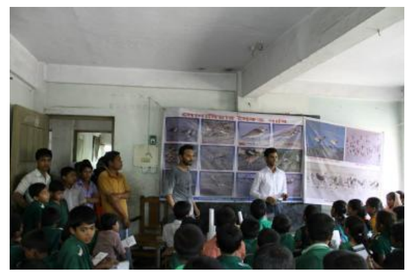
Ghotbhanga primary school, WMBD May 2013)